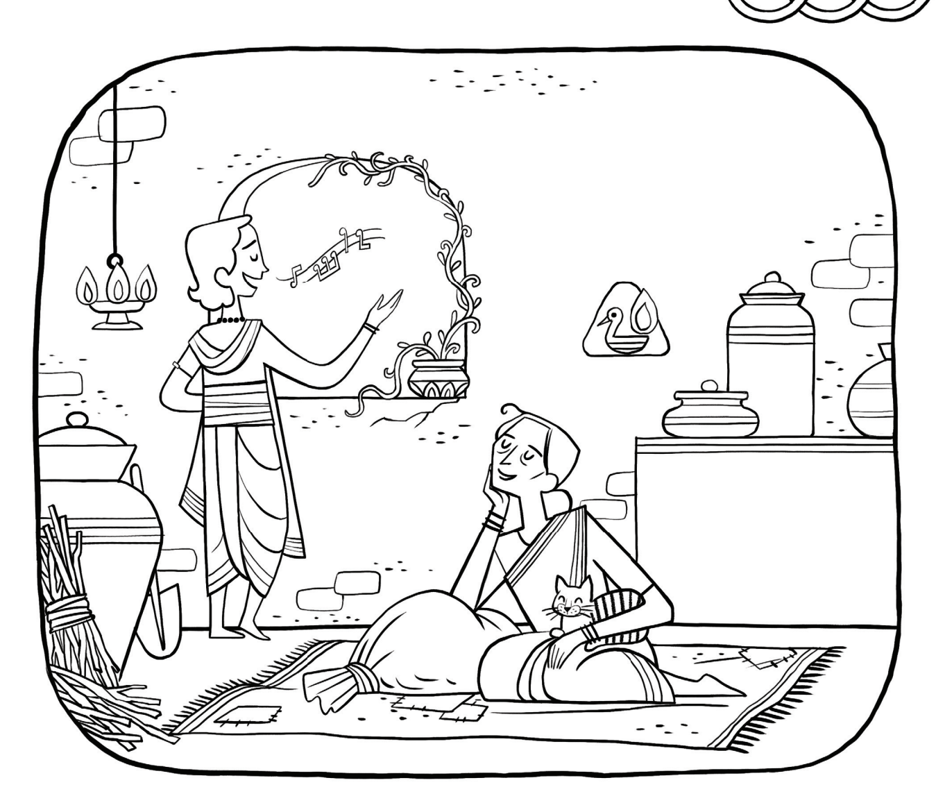
Learn more at leeandlow.com f 🈏 💿 📴 @leeandlow